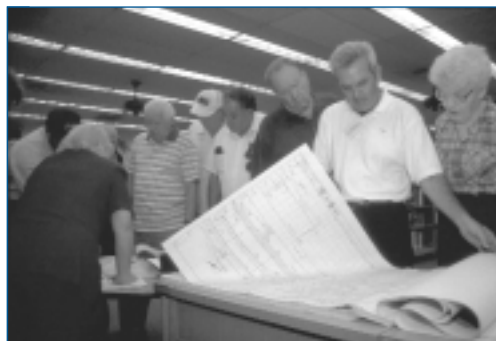
Public feedback helps identify study area problems and needs.

The principal highway serving the Northwest Corridor is I-75, an important link in the interstate system in Georgia and the Southeast United States. It also is the primary route for commuters and other traffic traveling between Midtown Atlanta and the suburban areas of Cobb County and Cherokee County. I-75 connects with I-575 in Cobb County for travel into Cherokee County. Both I-75 and I-575, as well as the major arterials in the corridor, currently operate with congestion, and the congestion is expected to increase with the projected growth in population and employment because the planned capacity improvements in the Mobility 2030 Regional Transportation Plan (ARC) cannot keep pace with future traffic demands.