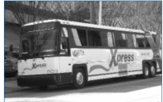
Example of a BRT Vehicle

Like the HOV/TSM Alternative, this alternative would provide for the extension of the existing HOV lanes on I-75 north of Akers Mill Road to Wade Green Road in Cobb County and on I-575, north to Sixes Road in Cherokee County and introduction of new express coach BRT services connecting residential areas and activity centers within the Northwest Corridor. The vehicles used in the operation of the service would be specially built coaches similar to the type used in the operation of intercity bus services. The coaches would be equipped with special amenities for passenger comfort such as high-back, padded seats, individual air controls, and luggage racks. This new coach service would operate in the existing HOV lanes on I-75 south of Akers Mill Road and the proposed new lanes to the north on I-75 and I-575.